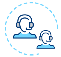
Experienced Staff Team