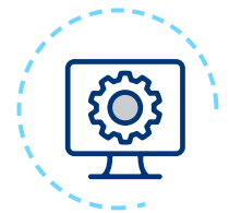
Custom Design and Content Build