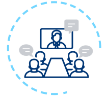
Interactive Virtual Event Platform