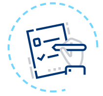
Pre-Event Planning and Support