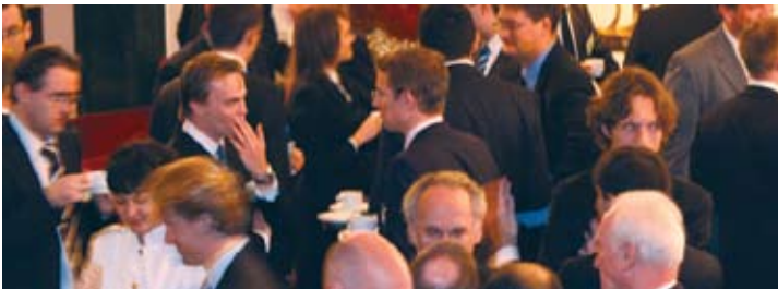
ABB • Airbus • Alstom • Arup • BT • Bayer • AXA • Deloitte • Deutsche Bank • BP • Eon • Esso • GE • Globus • Goldman Sachs • IBM • Kraft • KPMG • Lufthansa • Miele • Mouchel • Munich Re • Nokia • Novartis • Siemens • Thyssen • Volkswagen & many many more

80% of the top 500 European Companies attend C5 conferences including: